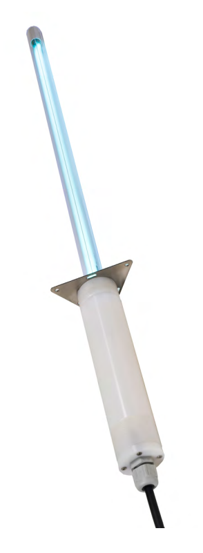
Detail of the UV-PIPE-F flange